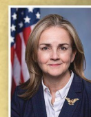
CONGRESSWOMAN MADELEINE DEAN 4th Congressional District